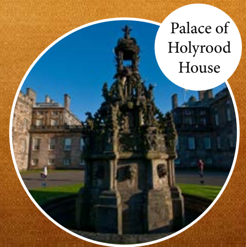
Palace of Holyrood House

Theme: Emerging Trends and Innovations in Power and Energy Engineering