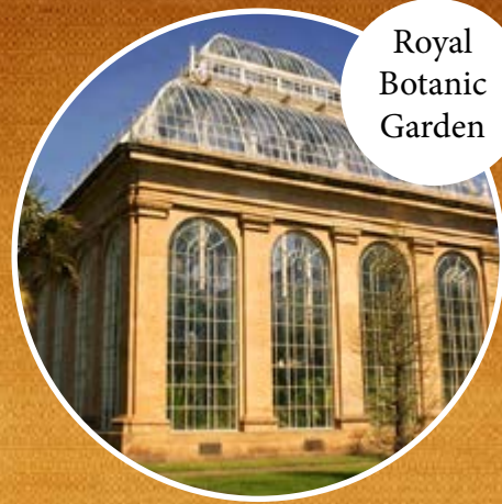
Royal Botanic Garden