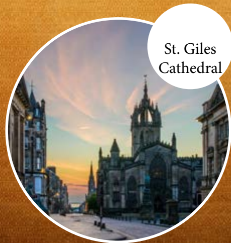
St. Giles Cathedral